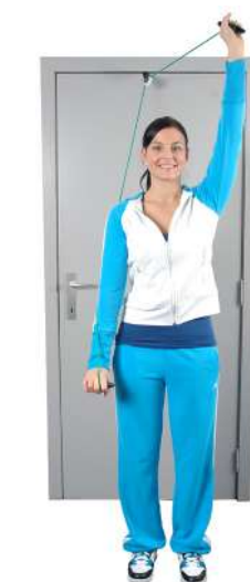
Up and Down Back to the Door