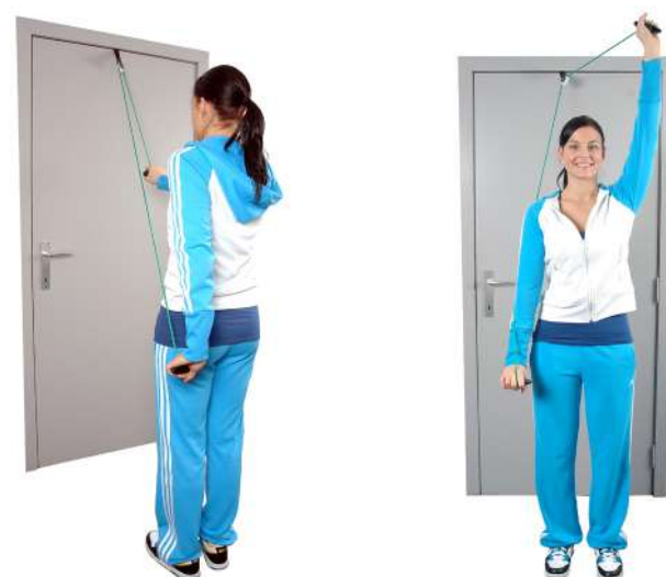
Up and Down Facing the Door

All these exercises can also be performed in a standing position: