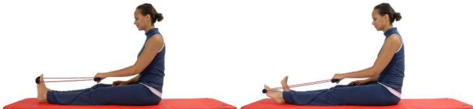
O-Ring - Leg Stretch

Sit down, stretch your leg, placing one o-ring handle behind your toes, while holding the other. Gently push your ankle down, as if you were in your car, stepping on the gas.