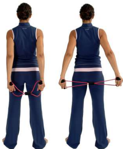
Figure 8 - Back Low

Hold the Tube Loop behind your back with your arms straight. Pull both arms outwards.