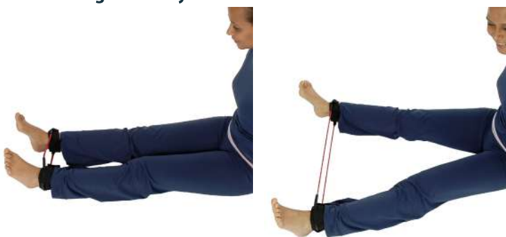
Cuff Ring - Sideways

Attach the velcro cuff-rings to your ankles. Sit down, stretching your legs forward. Push both legs slowly outward at the same time and return to starting position.