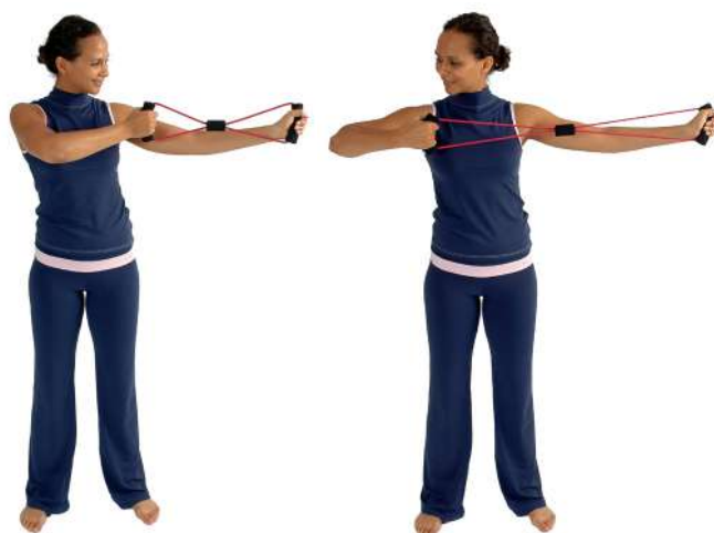
Figure 8 - Archer

Hold the Tube Loop to your side with one arm stretched. Pull the other arm away, mimicing the movement of an archer.