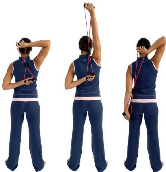
Figure 8 - Back Top

Hold the loop between your shoulder blades, parallel to your spine. Pull one arm up. After lowering it back to the starting position, pull the other arm down. After your repetitions, switch arms.