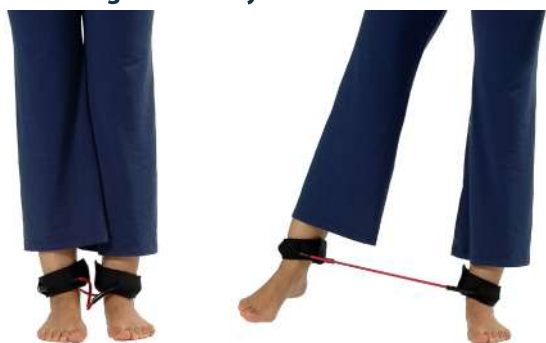
Cuff Ring - Side Sway

Attach the velcro cuff-rings to your ankles. Stand on one leg, pushing the other slowly outward. Keep a stable object nearby for support if needed.