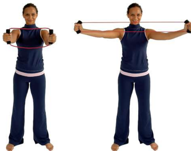
O-Ring - Horizontal Stretch

Hold both handles from the Loop in front of you and stretch it horizontally to the outside.